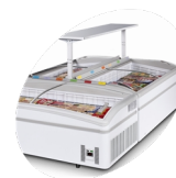
Island installation, shelves as assessor